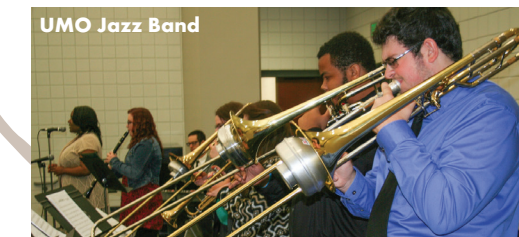
UMO Jazz Band

Come and listen to an exciting night of jazz music performed by University of Mount Olive music students.